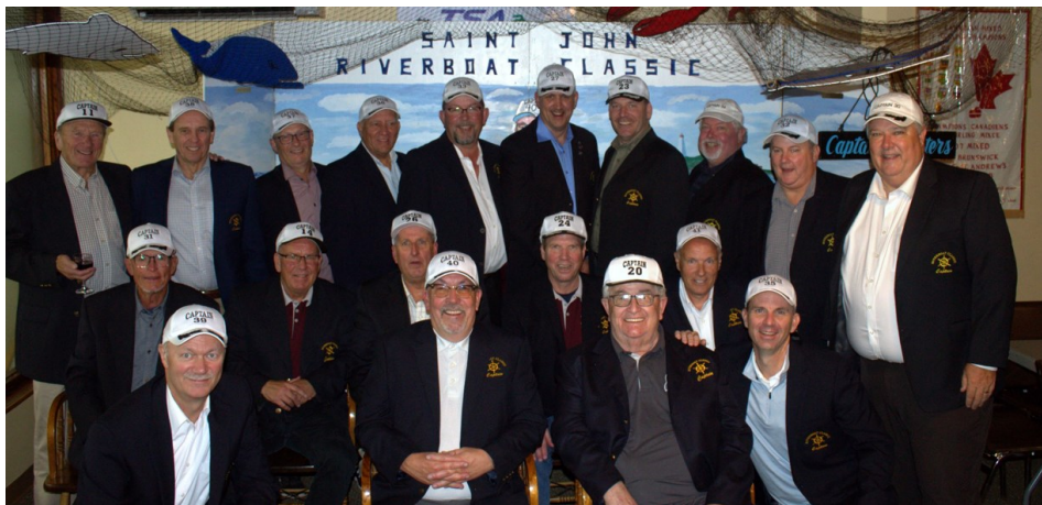
Past Captains Welcome You!

It's Autumn. The leaves are changing and the air is brisk. You've already eaten too much of that candy you thought you were going to give out on Halloween. So put down that Hershey bar and pick up a refreshing beverage. It's time for the 41st Riverboat Classic!